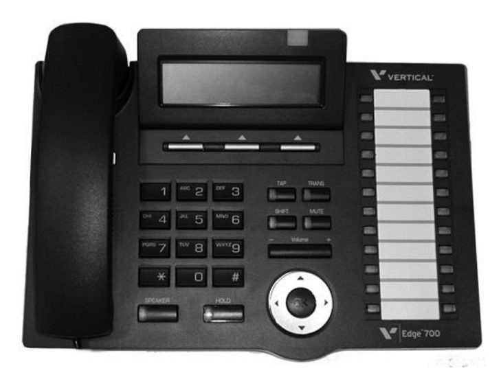
Edge 700 (digital)

8/24-Button Keysets 3 Soft Keys Message Waiting Light Programmable Keys FIXED BUTTONS: Hold